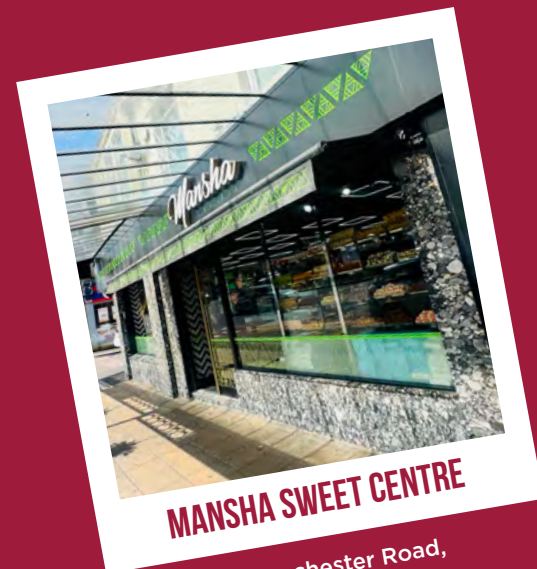
MANSHA SWEET CENTRE

Celebrate our local businesses and #ShopLocal!