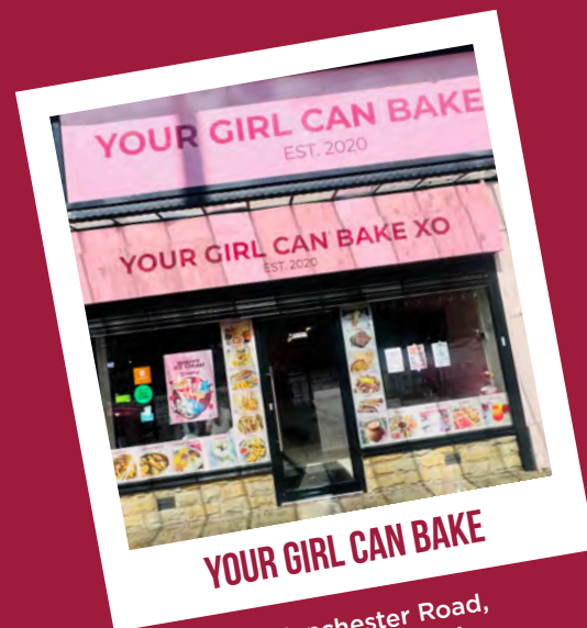
YOUR GIRL CAN BAKE