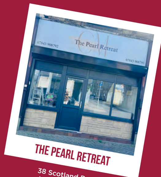
THE PEARL RETREAT